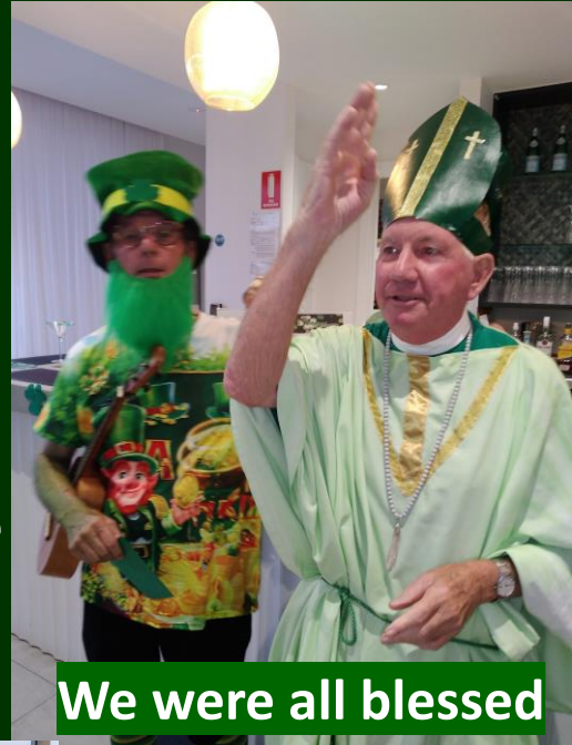
We were all blessed

More than 80 people attended our St Pat's celebration. Everyone enjoyed the craic, the Irish music and our own ukelele band.